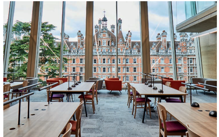
Our state-of-the art library, housed in the Davison Building.