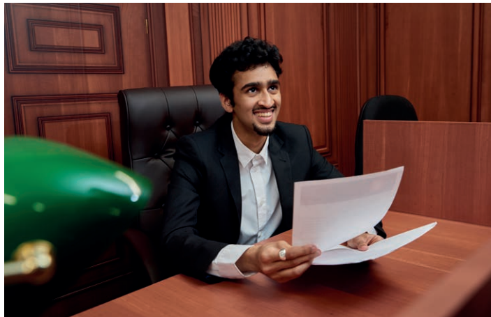
Student in our mock court room

Our mock court room, computer labs and library resources are conveniently situated a couple of minutes away.